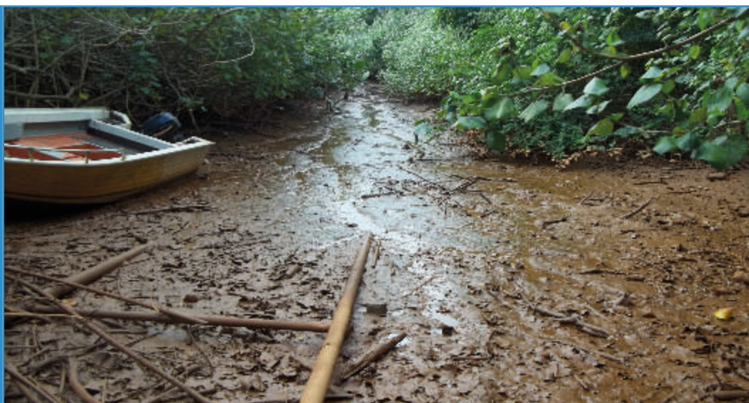
A creek with mining waste sediment in the delta of the Rio Doce near Regência

Detailed proposals have only been made for a pilot area just below Paracatu de Baixo (Zone IV), for the area of Bento Rodrigues and for further work on the reservoir of the Candonga Dam. In the pilot area, it is proposed to use mechanical draglines to remove sediment from the river-bed and use this