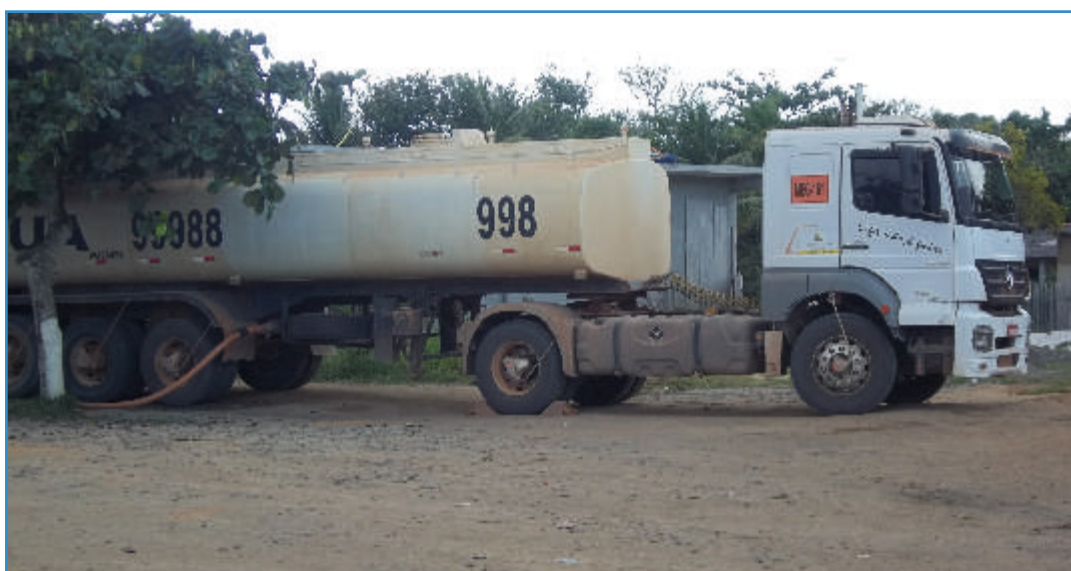
A tanker-lorry delivering water to Regência because of suspected contamination of the river and groundwater. The lorries come from Linhares, about 70 km away and cause damage to the roads. (Paul Robson)

The passage of the tidal wave of mining waste through the river basin caused the immediate interruption of water extraction from the river. This affected domestic water supply, irrigation, water for animals and water for industry. In Barra Longa, the wave of mud damaged water pipes and infiltrated wells in the flood plain. Below the Candonga Dam, the heavy load of sediment in the water led to the suspension of water availability in places where the supply came from the river as water treatment could not be carried out on water with such a heavy sediment load.