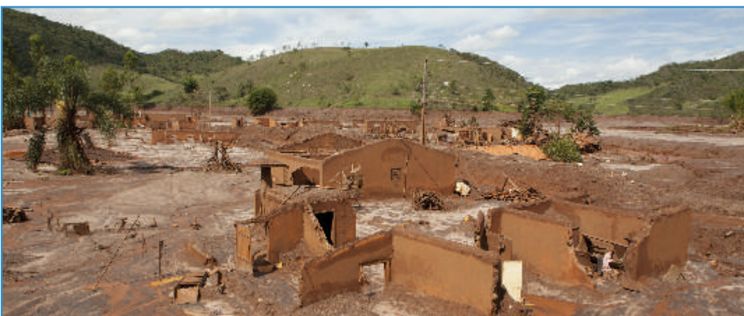
A month after the collapse of the Fundao Dam Paracatu de Baixo is a scene of devastation. (Nilmar Lage)