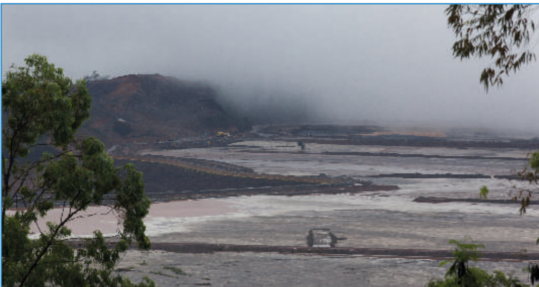
A view over the tailings ponds near the Germano Mine, showing their size and what is behind a tailings dam. (Nilmar Lage)

On 5th November 2015, the Fundão tailings dam in the Mariana District of the state of Minas Gerais, in the Federal Republic of Brazil, operated by the SAMARCO mining company, burst, releasing a total of 45 million cubic metres of mining waste. At an altitude of about 1200 metres above sea level, the Fundão Dam was a holding structure for waste material from the processing of iron ore of the Germano Unit of the Samarco Mining Company. It was one of the megastructures of the Germano mining complex. There are two other dams in the complex, Santarém and Germano, the latter being the highest dam in Brazil, with a height of 175 metres and a projected volume of up to 160 million cubic metres of tailings (Carmo et al., 2017, page 2)