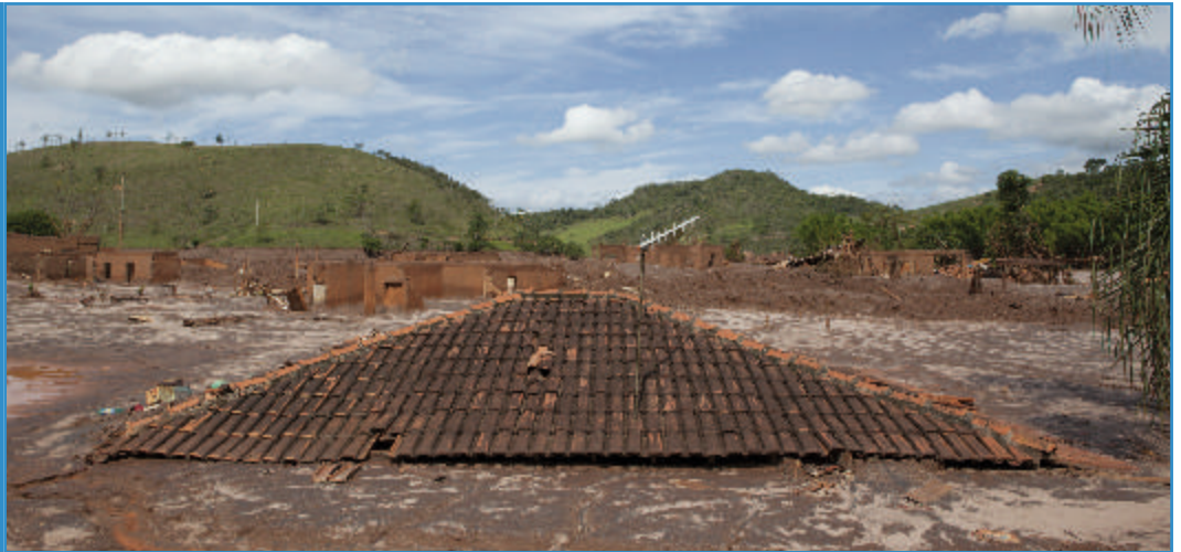
A month after the collapse of the Fundao Dam, just the roof of a house is showing above the mud in Paracatu de Baixo. (Nilmar Lage)

In general, larger-grained waste material was carried as far as the Candonga Reservoir and was retained in that location. Larger-grained waste material is therefore found in zones I to VI. Above Candonga Dam, the waste materials are composed mainly of quartz (about 60% by weight) and haematite (about 35% by weight), essentially fine sand, and are usually close to river banks. As a result of this the material lacks cohesion and is highly susceptible to erosion. When it is remobilised by erosion this material moves directly in the water courses. When it is disturbed by remedial works, it also tends to flow into the water courses or creates clouds of dust.