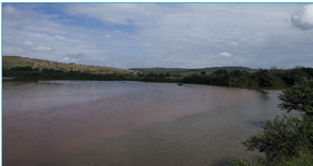
The confluence of the Rio Doce and the Rio St Antonio at Naque. More than 18 months after the collapse of the Fundão Dam, the Rio Doce is still brown and contrasts with the clear water of the Rio St Antonio (coming in from the right). (Nilmar Lage)

It is clear that, as with the emergency actions already carried out, the actions involved in the removal and stabilisation of deposited waste material will have further impacts. Those mentioned include heavy traffic and presence of lorries and earth-moving machinery, a temporary increase in turbidity of the water courses due to earth-moving works and disturbance of the river banks, loss of agricultural and pastoral areas due to their use as deposits for waste or the construction of erosion-control structures, creation of dust in the air during earth-moving, and destruction of natural vegetation by access roads and work sites.