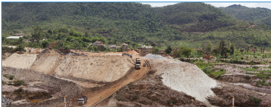
Construction of dam S3 at the settlement of Bento Rodrigues. S3 is a sediment weir, an attempt to reduce the amount of sediment entering the river system from the area of the mine and the collapsed tailings dam. (Nilmar Lage)

water-courses. Sediment weirs S3 and S4 have been constructed on the Corrego Santarém above and below the settlement of Bento Rodrigues. These are to reduce the amount of mining waste flowing downstream by acting as sediment traps. They have raised the river level so the agricultural lands of Bento Rodrigues are under water, and this makes it difficult for the former residents of Bento Rodrigues to imagine that they will be able ever again to have access to their lands. The construction of these weirs was opposed by the residents of Bento Rodrigues as they say that it was not discussed with them, they received no compensation, and they fear losing their property rights.