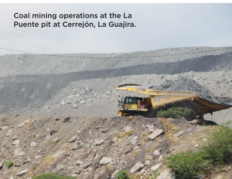
Coal mining operations at the La Puente pit at Cerrejón, La Guajira.

For this reason, together with the communities and organisations struggling to defend their territories and who invited us to carry out this International Mission, we call for the dismantling of this unfair system, which provides an exclusive pathway to guarantee the profits of transnational corporations and which violates the human rights of communities.