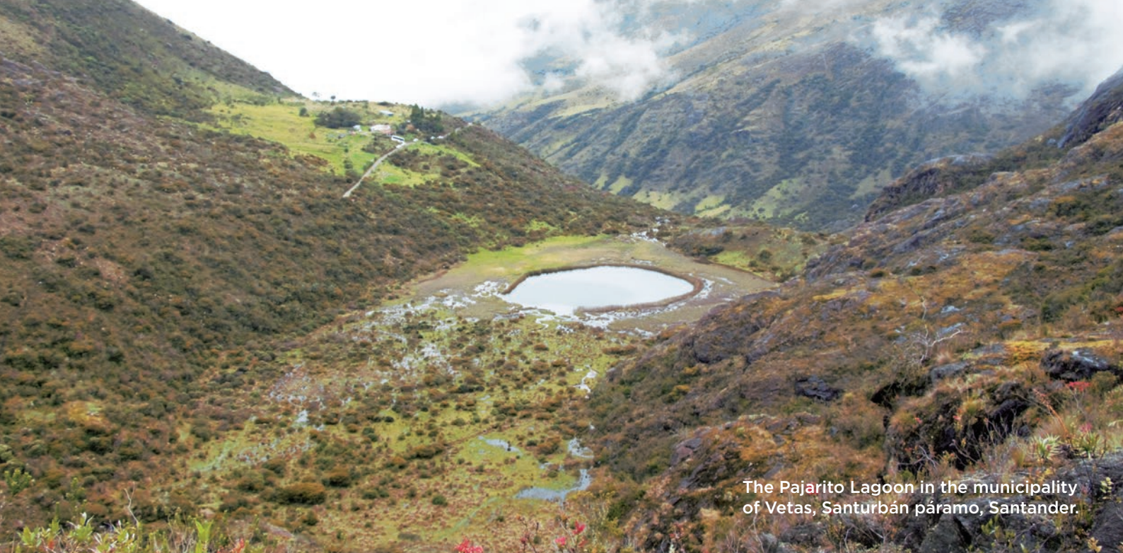
The Pajarito Lagoon in the municipality of Vetás, Santurbán páramo, Santander.

The project was blocked by a Constitutional Court decision prohibiting mining in the páramos, as well as a strong popular mobilisation led by the Committee for the Defense of Water and Santurbán Paramo, who underlined the threat that commercial mining posed to one of the country's most important ecosystems. In September 2021, the arbitration tribunal ruled against Colombia, but the final amount to be paid is not yet known. Two other Canadian companies, Galway Gold and Red Eagle, have sued on the same basis.